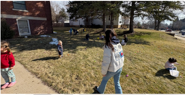
Egg Hunt and Taco Meal